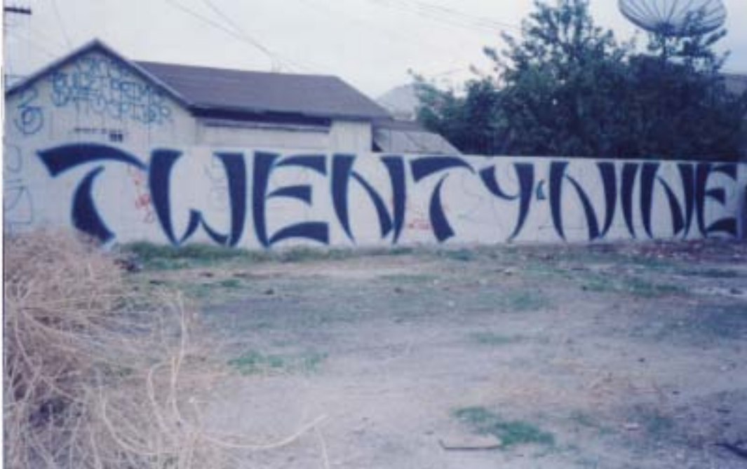
Figure 5. A placa of a Hispanic gang that goes by the name of “Twenty Nine” on the east side of Los Angeles in 1996. Notice the large pointed letters and the two colors used.