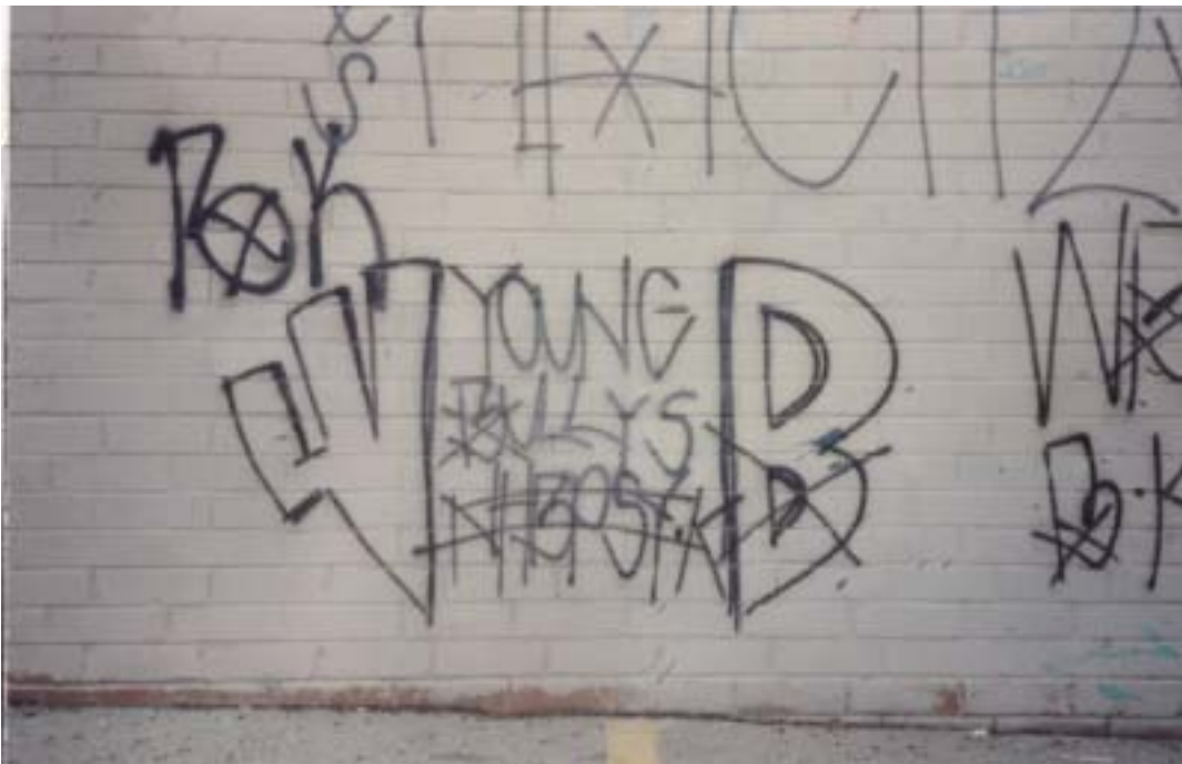
Figure 10. African-American gang graffiti of the West Boulevard Crips from Los Angeles. They usually represent their gang by writing WB, and they have adapted the use of the Warner Brothers logo during a time when African-American television shows have become popular on the Warner Brothers Network (1995).