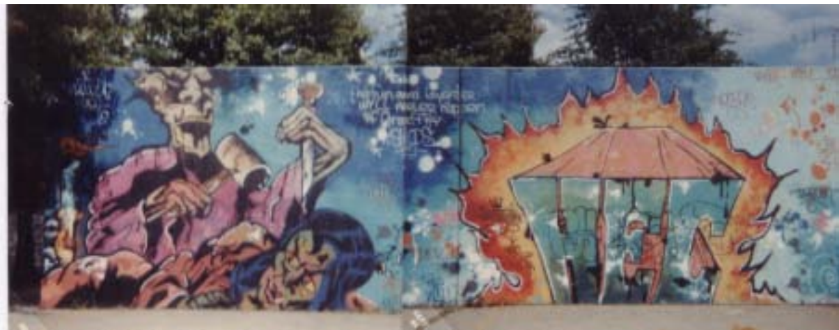
Figure 4. A Piece taking up the entire handball court. The caption in the centers reads: “...the fun and laughter will never happen in Graffiti STOPS.” Photo taken in August 1985 in the Williamsburg community of Brooklyn, New York.