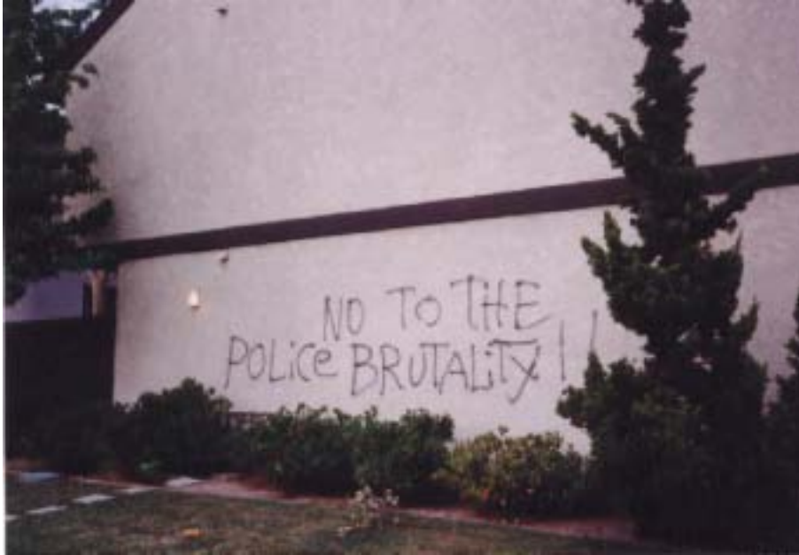
Figure 1. Graffiti written in response to the not-guilty verdicts of four Los Angeles police officers, who were accused of beating motorist Rondey King. This photo was taken on April 30, 1992 during the height of the Los Angeles civil unrest.