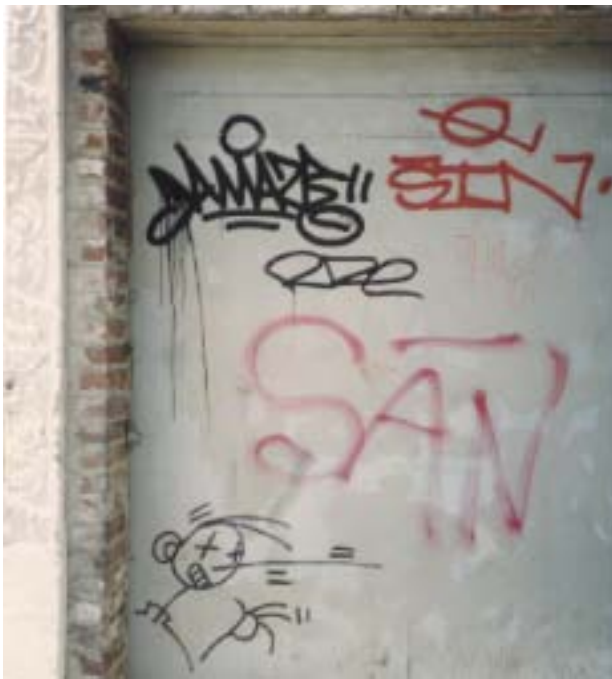
Figure 2. Five tags of individuals nicknamed Amaze, Sin, Rize, Sar and San. Notice the extreme stylization of the tag of Amaze, which would be unreadable to some. This photo was taken in San Francisco, June 1996, but this tagging is representative of how it is performed nation wide.