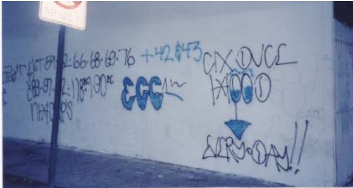
Figure 6. African-American gang graffiti of the Six Duce East Coast Crips of Los Angeles. Notice the use of the basic lettering style. The spelling of six is done with a “c” to reinforce their Crip identity. The arrow is used among African- American gangs to express territoriality, and in this photo the author is stating that this “hood” belongs to the 62 ECC Crips (1996).