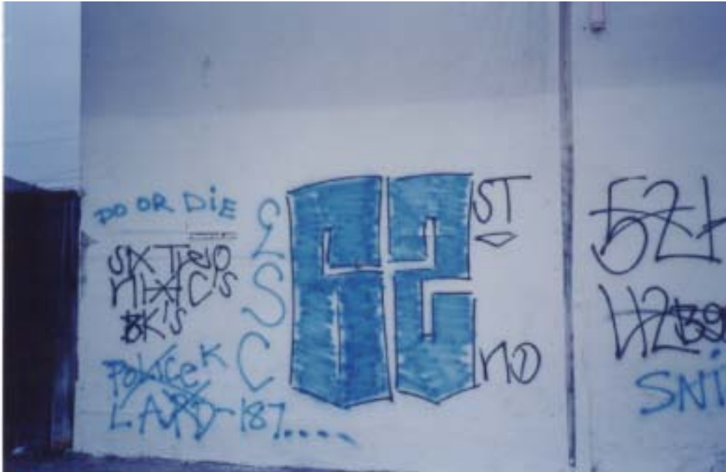
Figure 7. Gang graffiti of the Six Duce East Coast Crips of Los Angeles. At the bottom left their animosity towards the police are shown in the inscriptions “Police K” and “LAPD 187.” The “K” means Killer and “LAPD” is for Los Angeles Police Department and “187” means murder, from the California penal code. Law enforcement will view these writings as direct threats (1996).