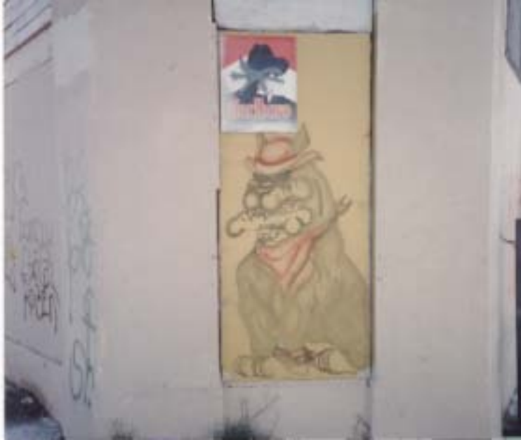
Figure 9. African-American gang graffiti of the Black P Stones, a Blood gang from Los Angeles. The pit bull is the mascot to most Blood gangs, and this painting is used as a territorial identifier to outsiders. Photo was taken in 1996.