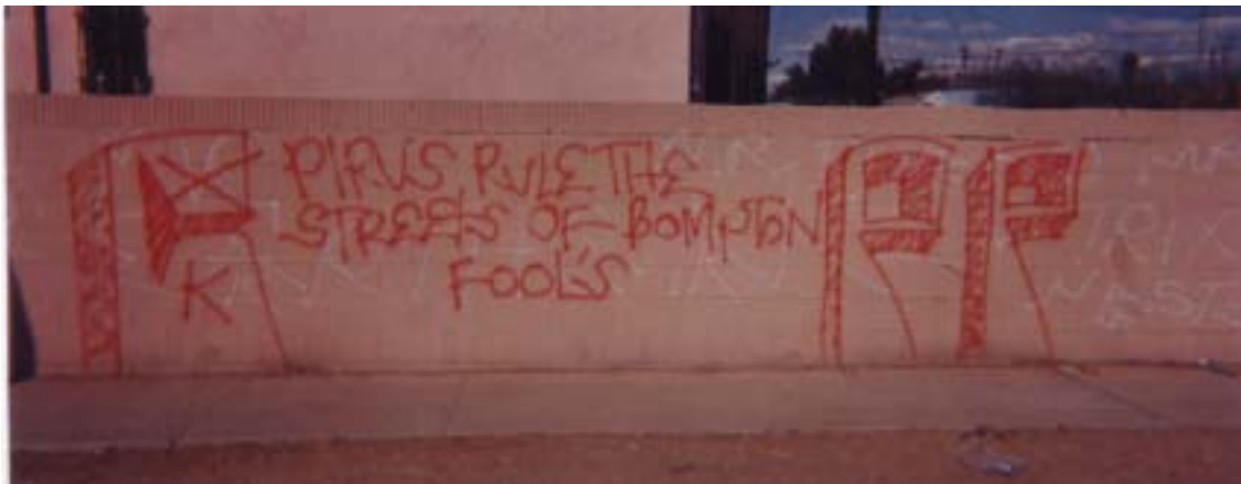
Figure 8. African-American gang graffiti of the Campanela Park Pirus of Compton, California. The caption says, “Pirus Rule The Streets of Bompton Fools.” Pirus are an agglomeration of several independent Blood gangs in Los Angeles County. Of the thirty African-American gangs in Compton, Pirus account for ten, and in this photo they are claiming supremacy over the entire city, and dominance over the twenty other Crip rivals. Also notice how they replaced the letter “C” in Compton with “B” to reinforce their Blood/Piru identity. Photo was taken in 1996.